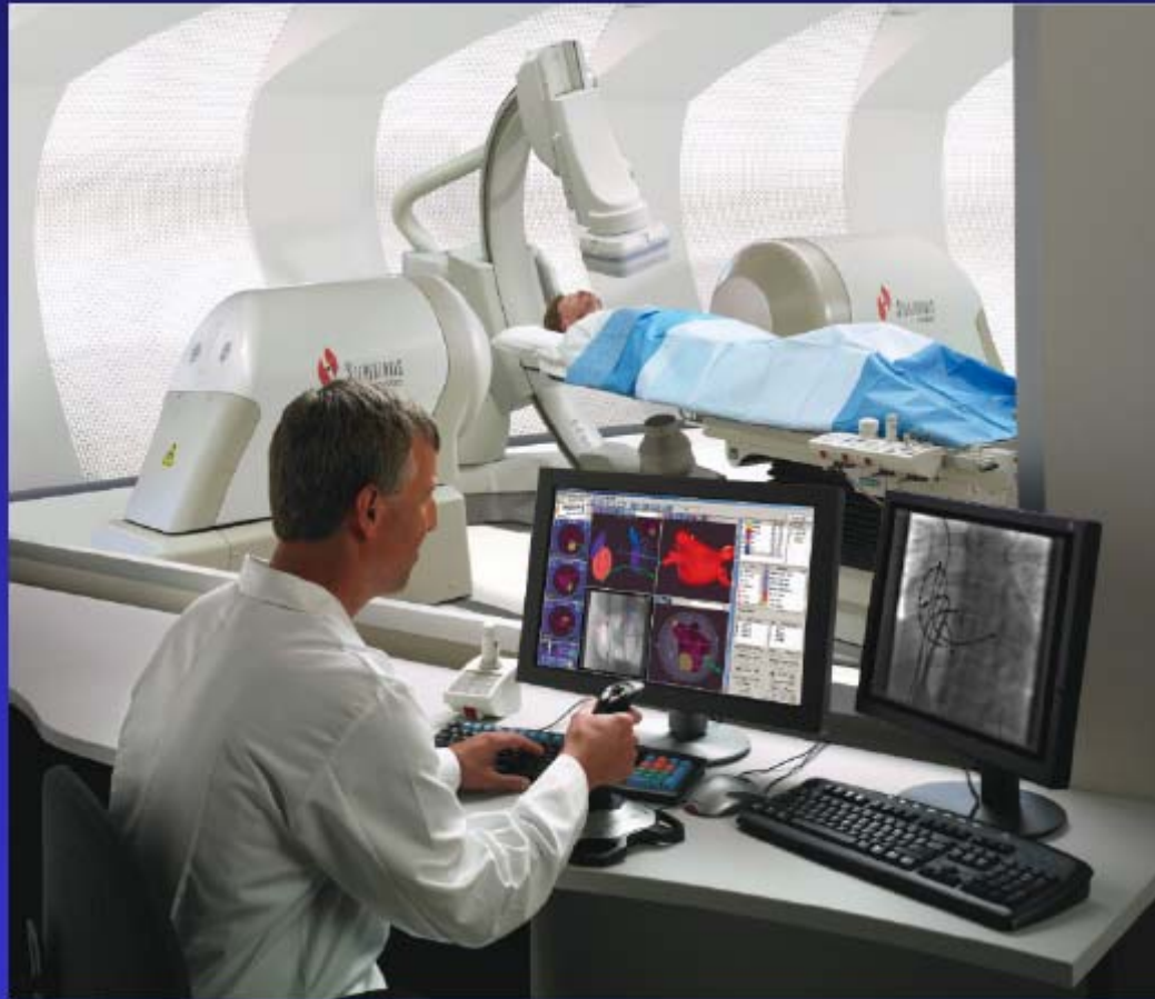
Stereotaxis, Inc. Niobe System